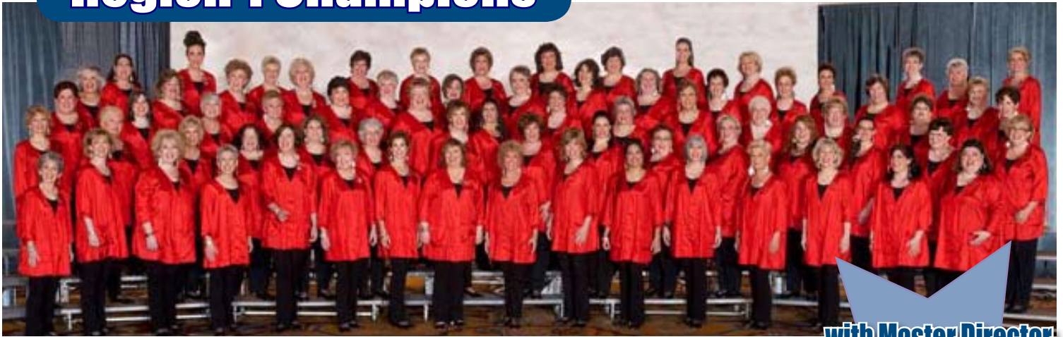
REPRESENTING REGION ONE IN DENVER CO • 2012