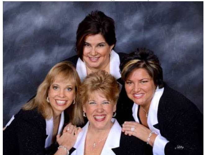
Second Place Quartet: Boston Accent

Most Improved Chorus: West Island Chorus (28 pts)