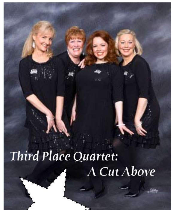
Third Place Quartet: A Cut Above