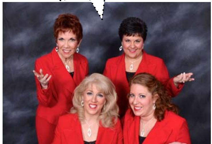
Fifth Place Quartet: Voice Activated