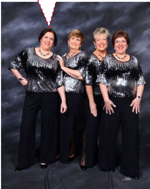
Fourth Place Quartet: Alakazam!